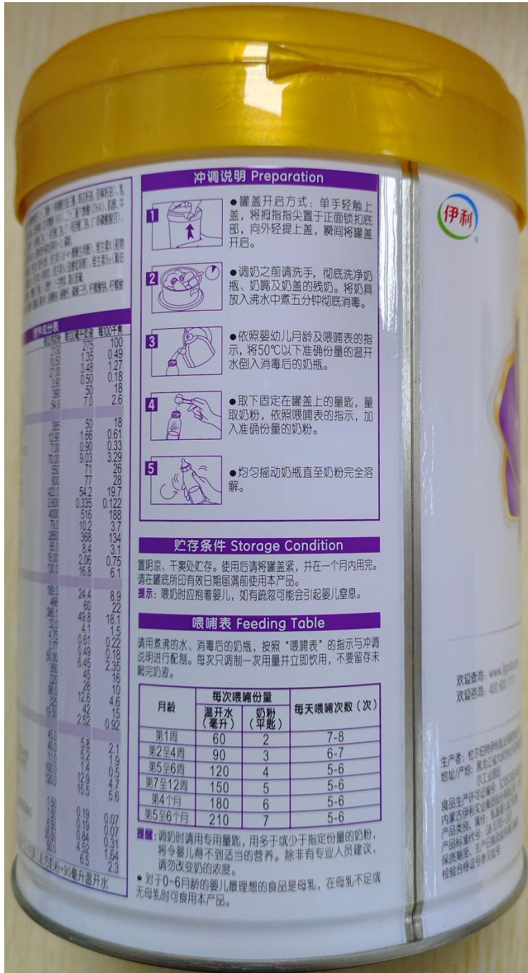
通标标准技术服务(青岛)有限公司 第 6 页 共 9 页